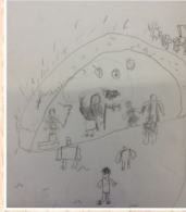
Thank you for joining us Happy Easter Have a wonderful holiday.